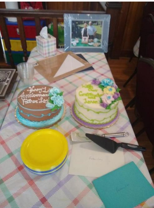
Welcome Home Initiative, Ordination Anniversary