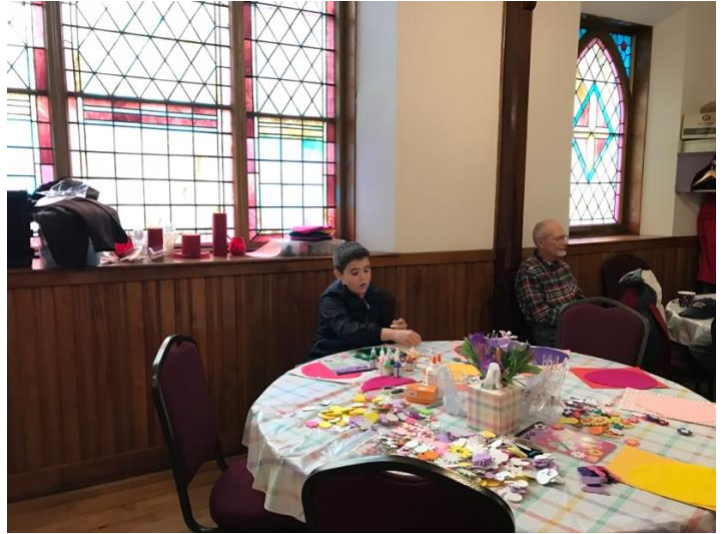
Easter Egg Hunt Event