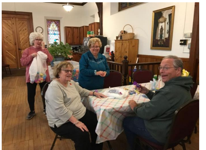
Easter Egg Stuffing