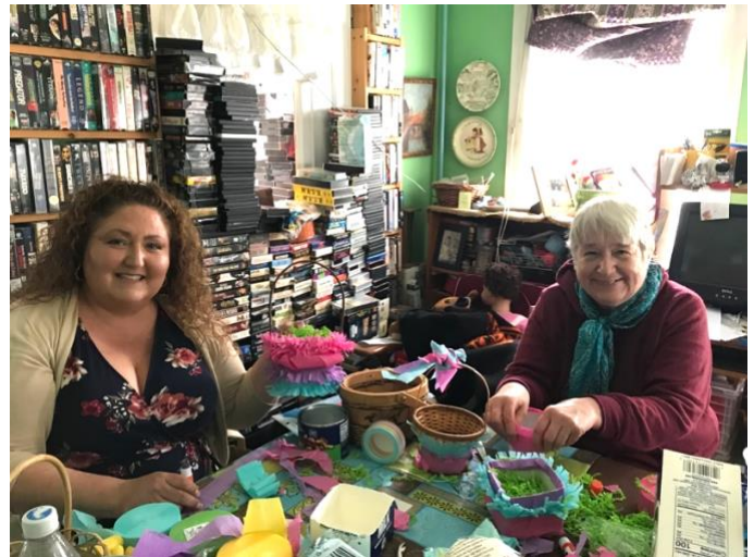
May Baskets, Maple in April Treat Bags