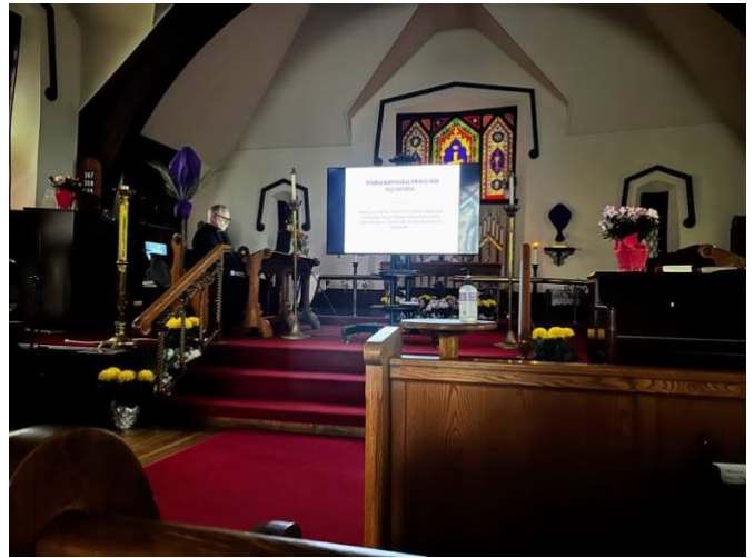
Altar Of Repose & The Tenebrae Service